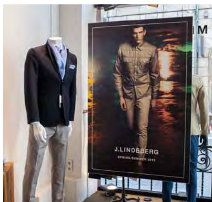
Double sided window application