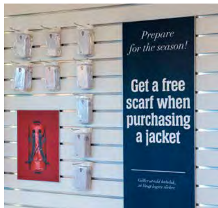
Fittings for slat wall