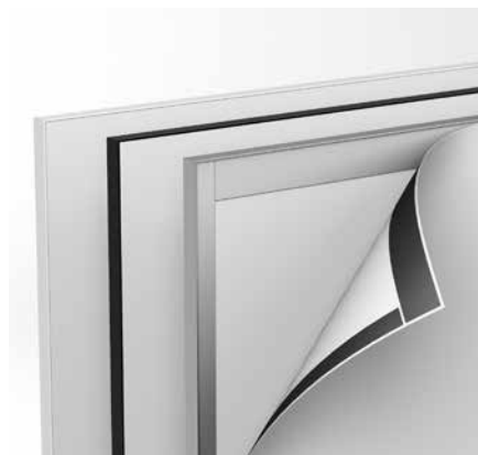
Magnetic frame 9 mm

FineLine is a system which provides a solution for most spaces in store. Our FineLine wall displays use a 9 or a 18 mm frame depending on the size . Since the display is wall mounted, this model is one-sided and you can easily change the banners since they have a thin magnetic strip around the whole reverse side.