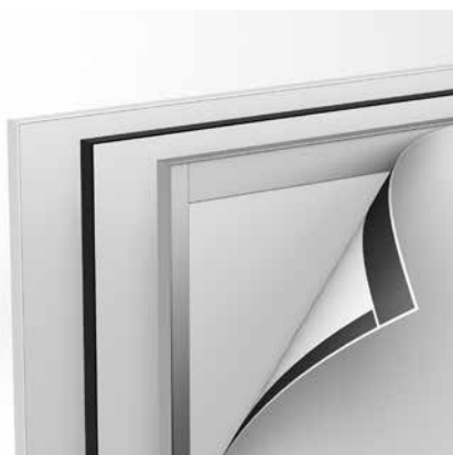
Magnetic frame 9 mm

Our hanging displays hangs from the ceiling on strong, discreet wires. This gives you the chance to use all types of spaces for inspiration, information and sales - for example, double-sided banners in a display window or hanging from the ceiling where floor space is limited.