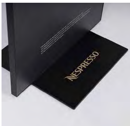
Printed logo on the baseplate