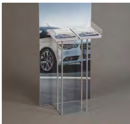
Demo- or brochure holders