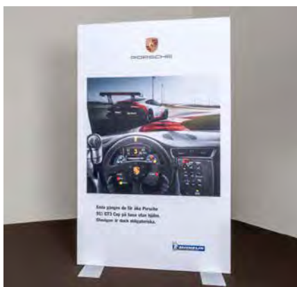
110 x 180 cm