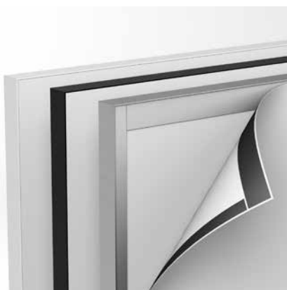
Magnetic frame 18 mm

The floor display has a frame with a depth of 18 mm, which is so discrete and stylish that it fits into the most demanding environments. The frame is double-sided and you can easily change the banners for each campaign. The banner is attached by a thin magnetic strip around the whole reverse side.